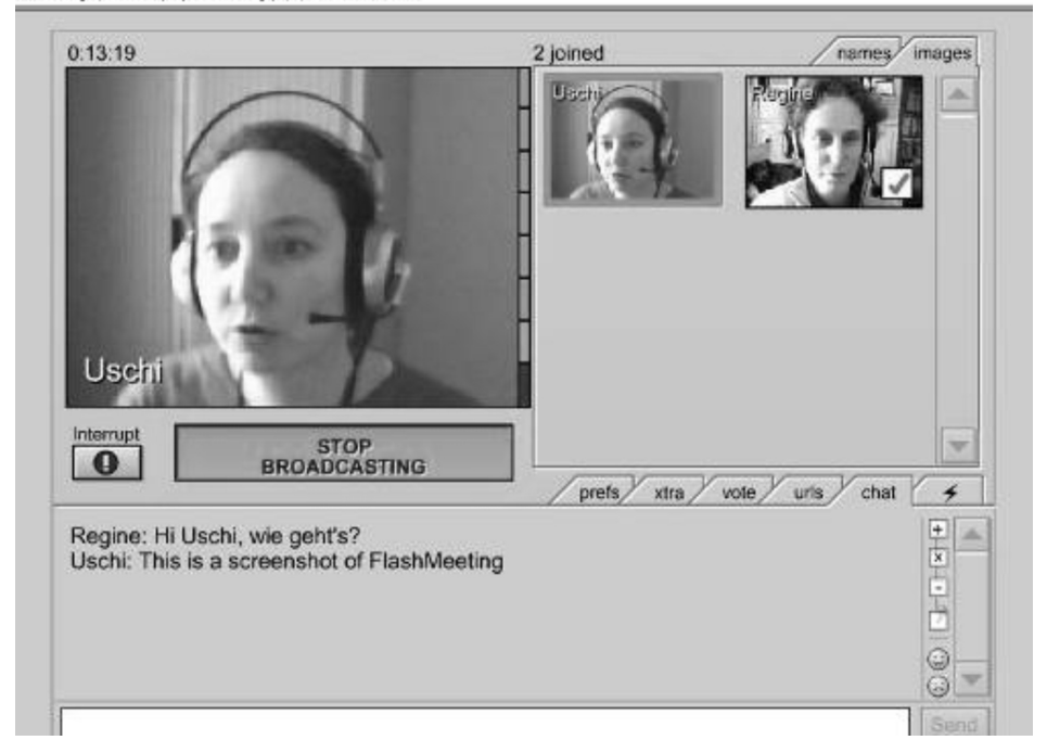
Illustration 2. Screenshot of FlashMeeting

Every tutor group had a written, asynchronous forum where tutors or students could raise questions and create new discussion strands. Students worked on their individual blogs and commented on other people's blogs; from week four on, they also worked on a collaborative group wiki about learning German online. Every week concluded with a short quiz on the Moodle website to allow students to review their learning.